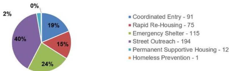
Percentage of the Total Number of Active Programs for the Month by Program Type

Percentage of Veterans: 2.24% Percentage of Domestic Violence Victims: 15.97% Percentage of Disable Inviduals: 42.02% Percentage of Chronically Homeless: 11.76%